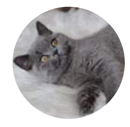
Name: Muffin Breed: British Shorthair (Blue) Gender: Male DOB: 17th March 2018 Status: To Be Neutered