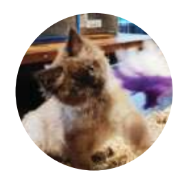
Name: Max Breed: Seal Sepia Ragdoll Gender: Male DOB: 17th March 2018 Status: Neutered