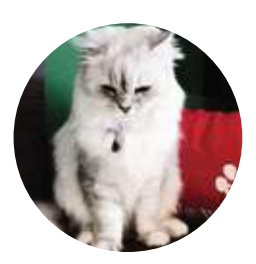
Name: Milo Breed: Ragamuffin Gender: Male DOB: 14th Feb 2014 Status: Neutered