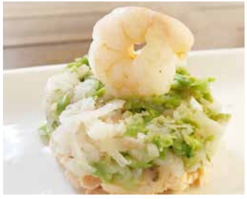
Baked Salmon with Prawn